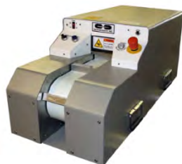
NSA Approved Degausser

Most commercial degaussers, or those not on the NSA's Evaluated Products List-Degausser , do not exceed 9,000 Oe, and are limited in their ability to provide complete erasure. In addition, the advertised field strength is often the maximum, but it is the minimum tells you a degausser's true capability.